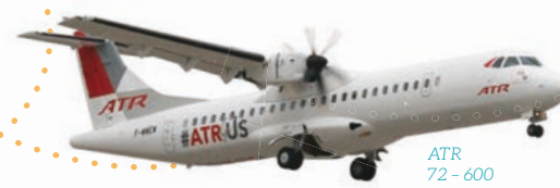
ATR 72 - 600