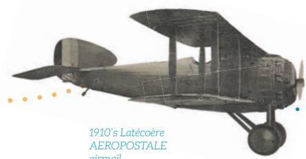
1910's Latécoère AEROPOSTALE airmail