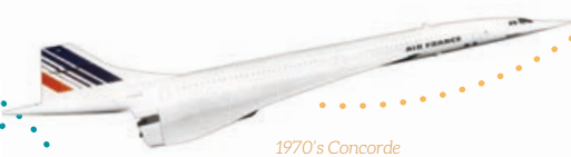
1970's Concorde Supersonic aircraft