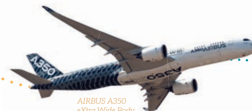
AIRBUS A350 eXtra Wide Body