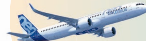
AIRBUS A320 neo